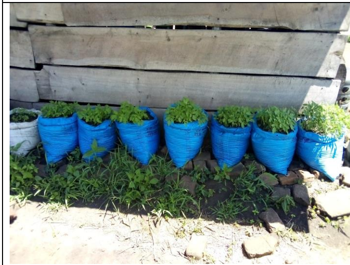
Tomatoes planted in Sacks in the Backyard