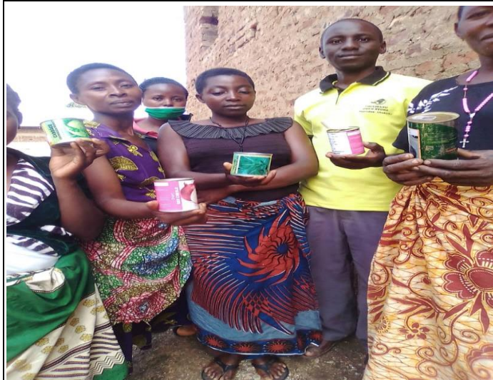
OVC CARE GIVERS GIVEN SEEDLINGS

As part of improving food security, 60 Household heads were trained by the sub county Agriculture extension workers on how to grow vegetables in backyard gardens as indicated in the photobook there under