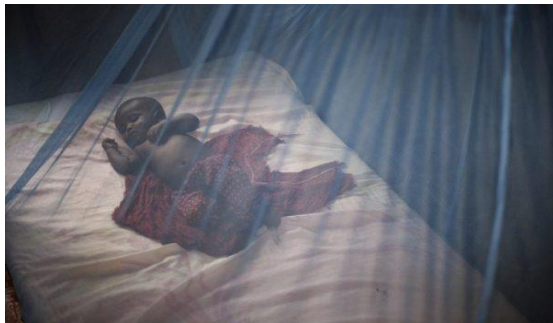
Fig2: OVC child sleeping under LLINs

(a).Beneficiaries gained comprehensive knowledge about the benefit of knowing ones HIV sero status as well as adopted positive practices and behaviors' such as consistent and correct use of Long Lasting Insect Treated Net (LLINs) and consistent and correct use of condoms for those that are sexually actively.