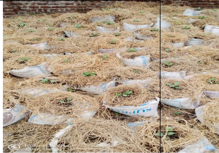
Cabbage Garden in the Backyard