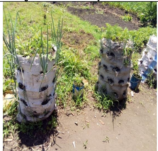
Onions planted in Sacks to Minimize space